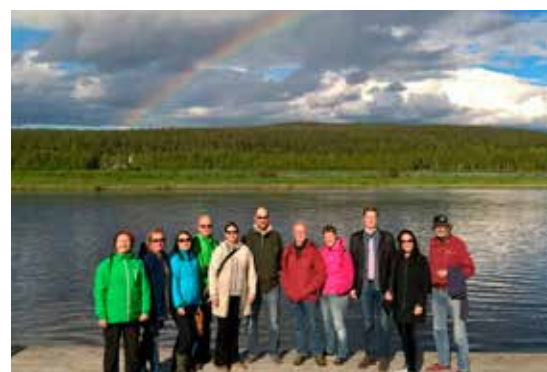
Editorial Group started its work at the kick-off meeting of the project in Rovaniemi, Finland in June 2017.

Arctic countries and Permanent Participants (Indigenous Peoples' organizations) of the Arctic Council have nominated an expert for the project. The coordinators are involved in the project by helping in bringing upfront specific Arctic features of each country, identifying EIA actors for a forming of the network, helping to collect good practice examples and eventually helping in drafting and crystallizing the recommendations. Coordinators form an Editorial Group . The nomination of coordinators was organized via the country and Permanent Participant representatives within the Arctic Council's Sustainable Development Working Group. Coordinators are: